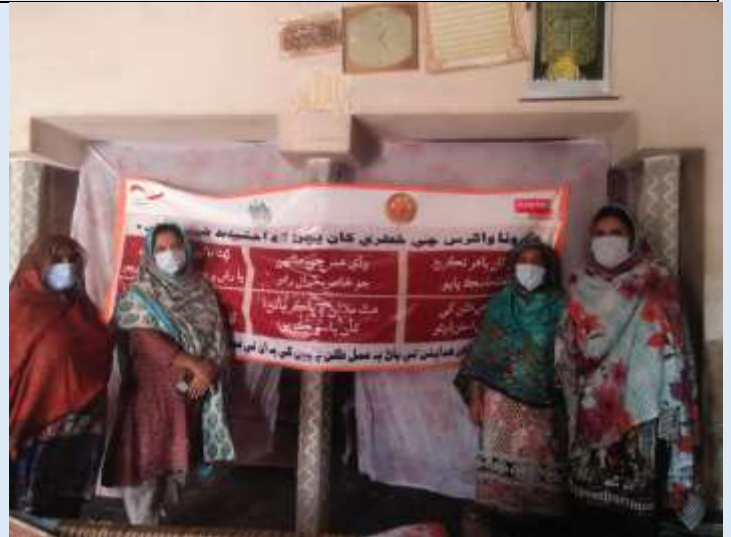
HelpAge team distributed IEC material and Awareness Session on COVID-19