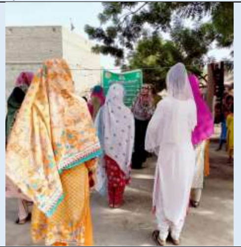
COVID_19 Community session at Khaipur