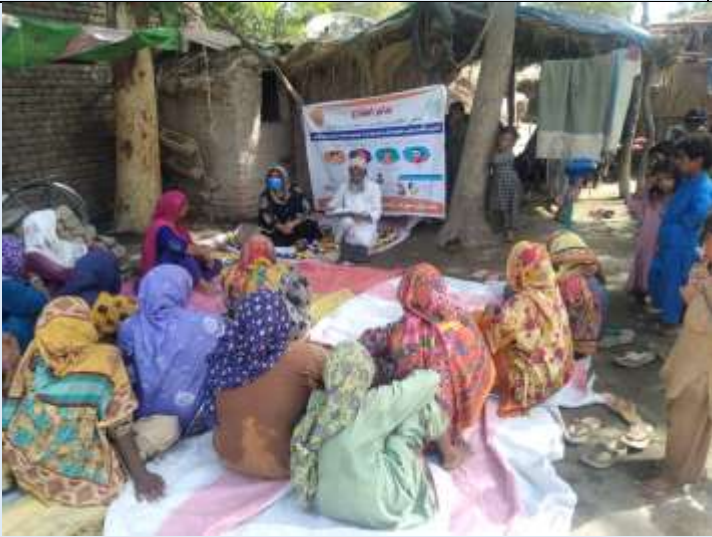
COVID_19 Community session at Shikarpur