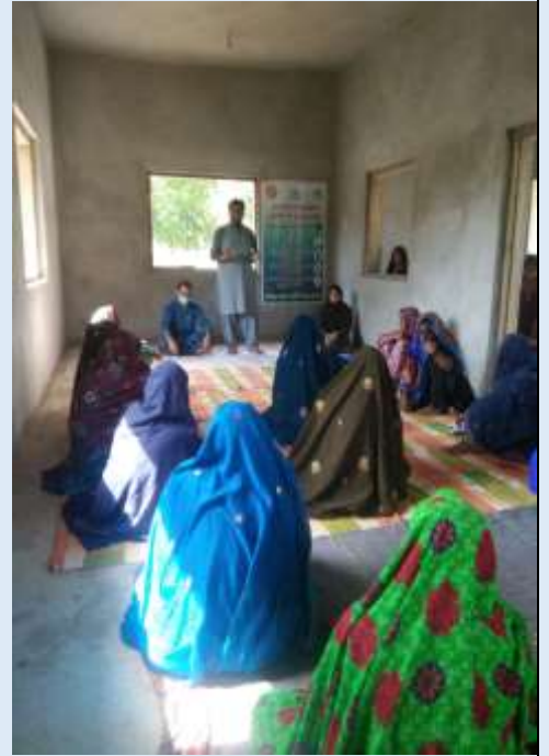
COVID-19 community awareness session at district Mirpurkhas