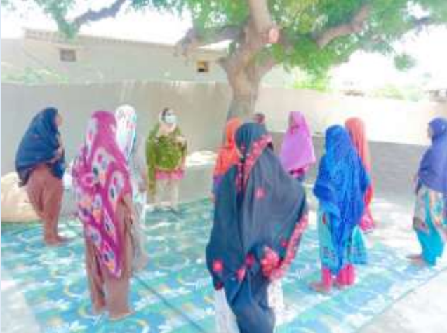
COVID_19 Community session at Badin