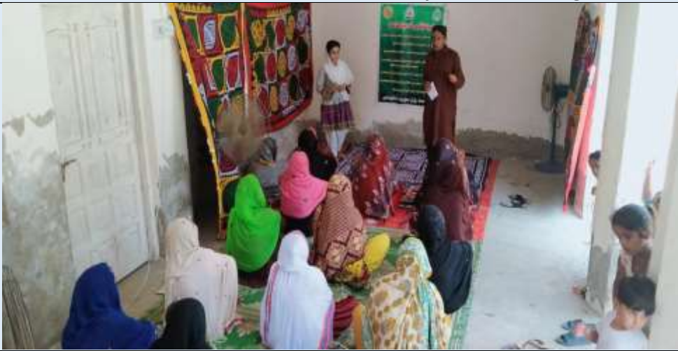
COVID_19 Community session at Khaipur Mirs