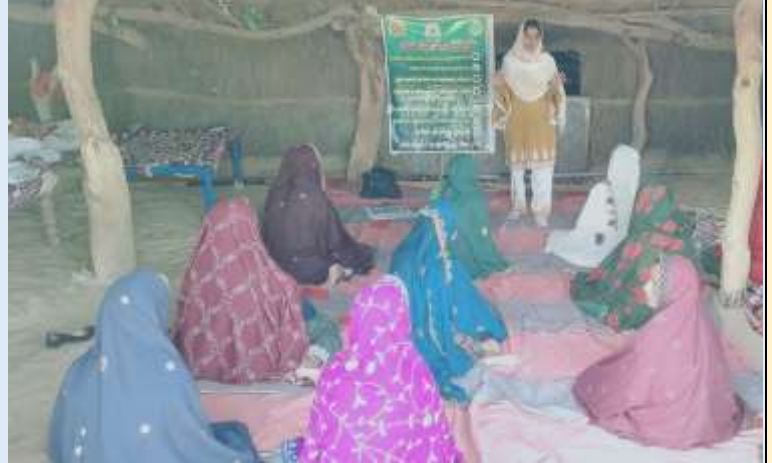
COVID_19 Community session at Khairpur Mirs